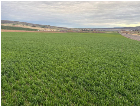
Union County on March 19, 2026.

The crop remains in very good condition, but will be dependent on moisture throughout the remainder of the growing season. With below-average snowpack and tracking the drought monitor, precipitation over the next month is necessary to determine final crop development.