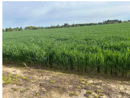
Benton County on April 19, 2026.