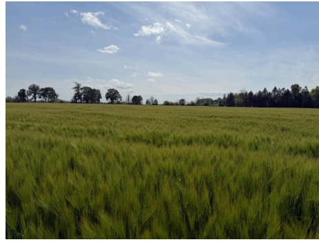
Winter barley in Linn County on May 1, 2026.