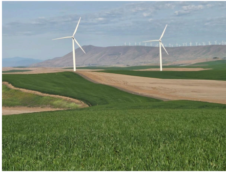
Dryland soft white winter wheat in Sherman County on May 1, 2026.