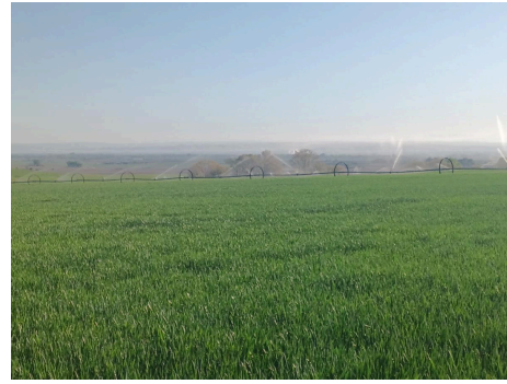
Irrigated soft white winter wheat in Malheur County on May 1, 2026.