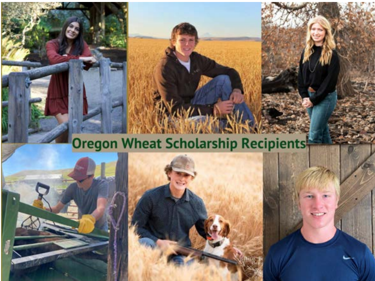
Oregon Wheat Scholarship Recipients