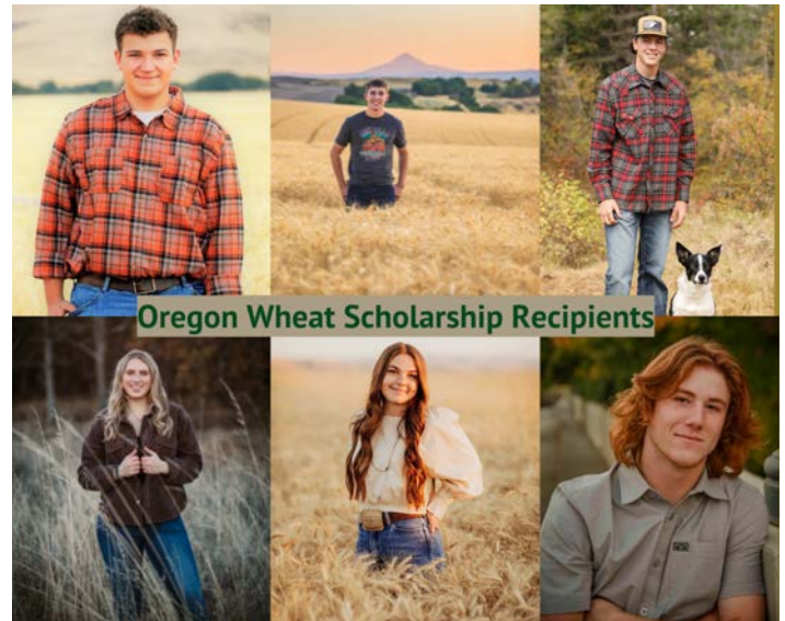
Oregon Wheat Scholarship Recipients