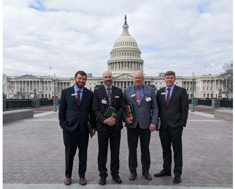
League representatives at the Mission to DC in January.

We also engaged in a Farm Bill Listening Session with members of the House Ag committee, sharing key wheat producer messages. We advocated for funding and research allocations, hosting congressional staff in tours of Oregon wheat research facilities.