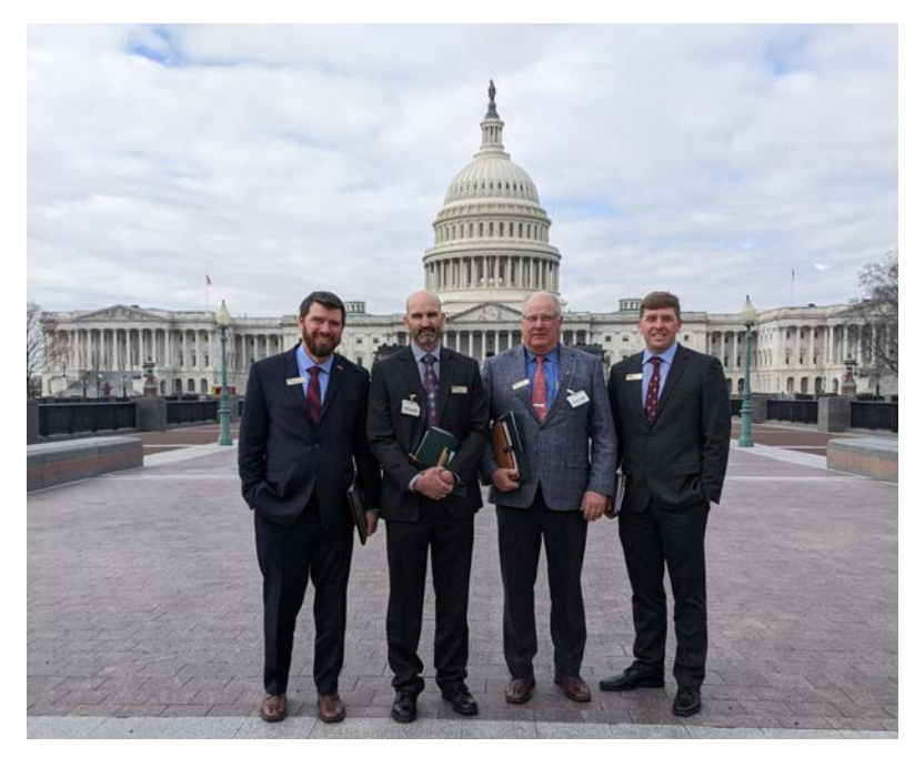
League representatives at the Mission to DC in January.

We also engaged in a Farm Bill Listening Session with members of the House Ag committee, sharing key wheat producer messages. We advocated for funding and research allocations, hosting congressional staff in tours of Oregon wheat research facilities.