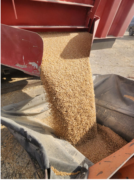
Unloading wheat in Wallowa County on August 26, 2025.