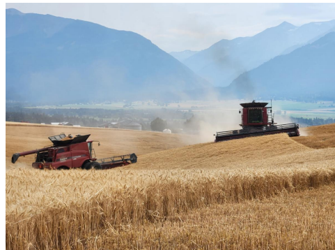
Harvest operations in Wallowa County on August 26, 2025.