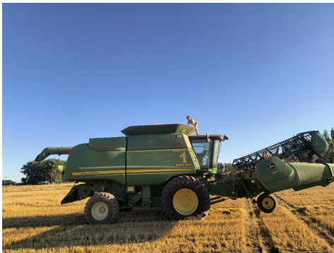
Klamath County wheat operations continued on August 28, 2025.

Harvest is nearly complete for Oregon, with the final high elevation areas finishing work. As we turn towards seeding for the next year's crop, this will be the final crop update harvest report for 2025.