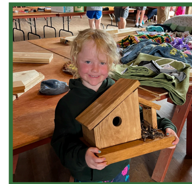
Exhibit Hall Auction - Items can leave the fairgrounds after payment.

Large Animal Auction - You will need to telephone the processor you select Monday after the auction to provide your cutting instructions. The processor will tell you when your frozen meat will be available to pick up.