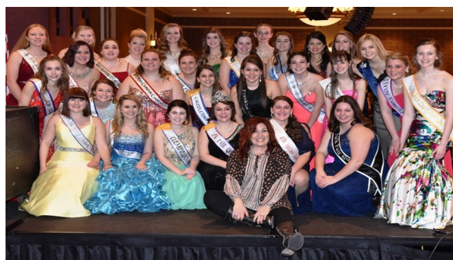
QUEEN CONTESTANTS WITH JO DEE MESSINA