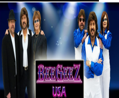
Left-BeeGeeZ USA Thursday PSACF Banquet