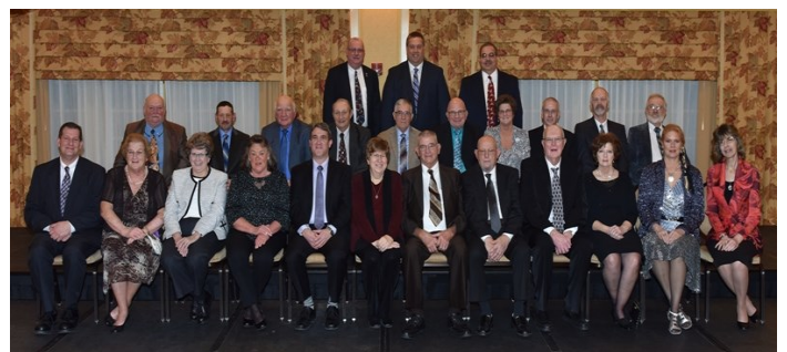
Right -2017-2018 PSACF Directors