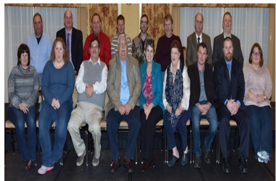
2017 PSSA Directors