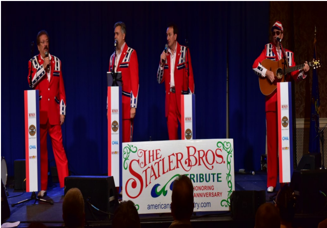
Entertainment Prior to Opening Celebration