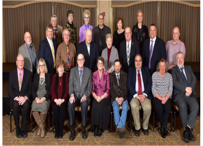
2022 – 2023 PSACF Directors