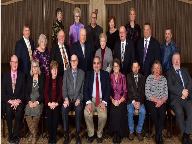
2022 – 2023 PSACF Directors