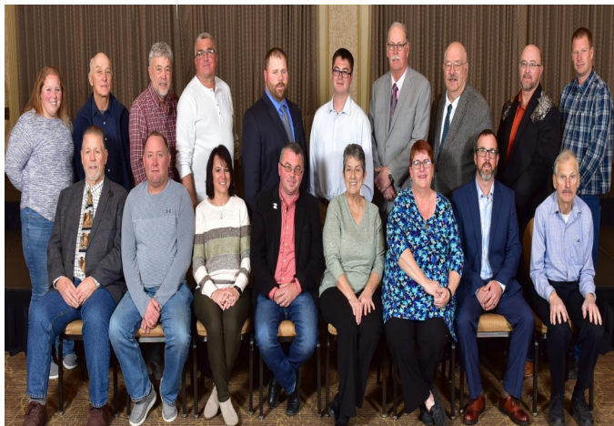
2022-2023 PSSA Officers and Directors