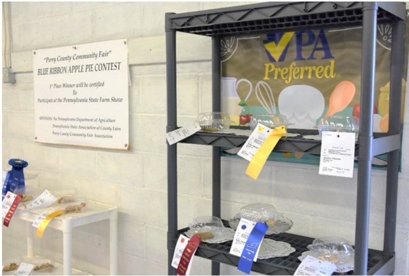
Figure 1: Special Baking Display at Perry County Community Fair

The 2021 Special Baking Contests have been in full swing. It has been encouraging to see the fairs re-opened and the baking entries and sponsor banners back on display.