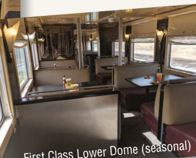
First Class Lower Dome (seasonal)