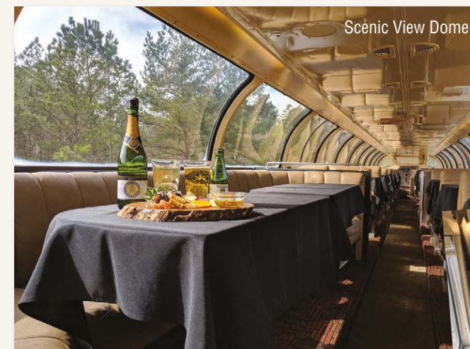
Scenic View Dome