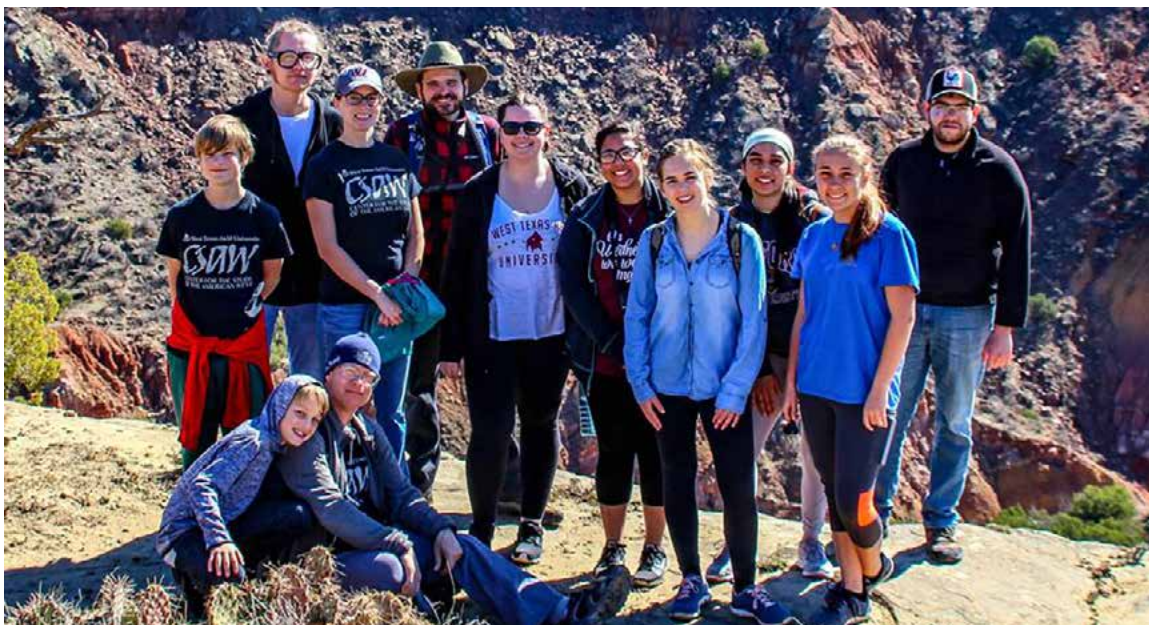
CSAW and friends on a special access tour at Palo Duro Canyon to assist with intern research about Civilian Conservation Corp work at the park in March 2019.