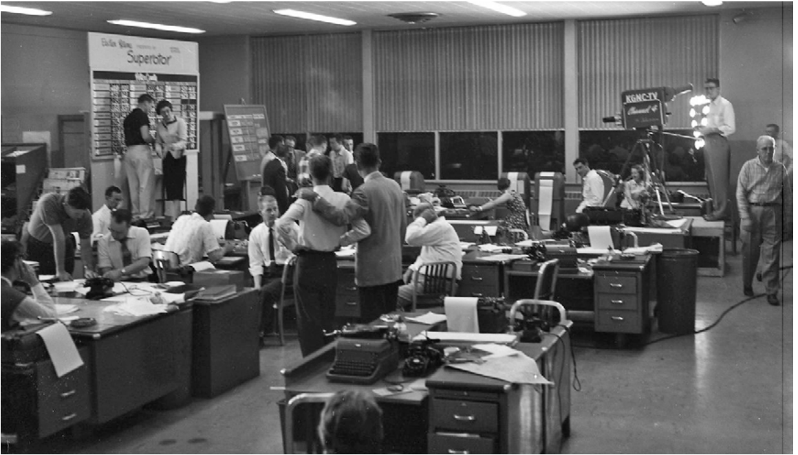
Newsroom of the Amarillo News, election night 1956.