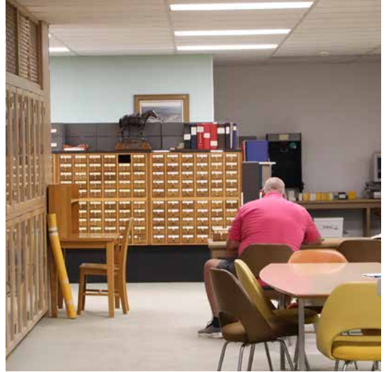
Researcher area in the PPHM Archives.