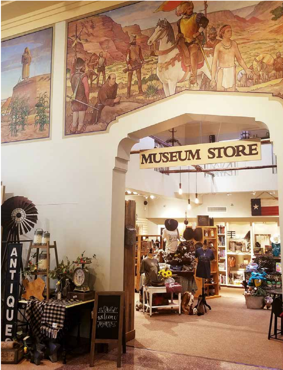
Museum Store is ready for autumn