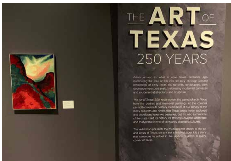
Georgia O'Keeffe's Red Landscape at the Witte Museum on loan from PPHM