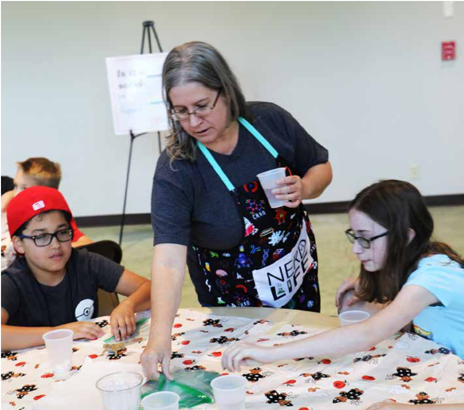
Pantex volunteers at Boulders, Brands, and Bones Summer Camp 2019