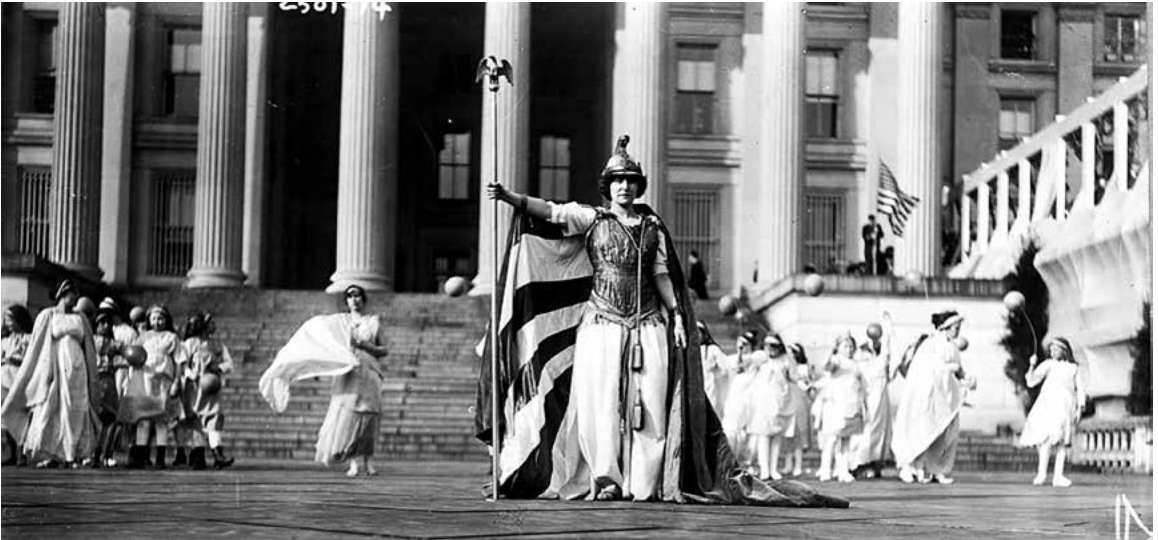
This photo is one inspiration for the exhibition- German actress Hedwig Reicher wearing costume of "Columbia" with other suffrage pageant participants standing in background in front of the Treasury Building, March 3, 1913, Washington, D.C.