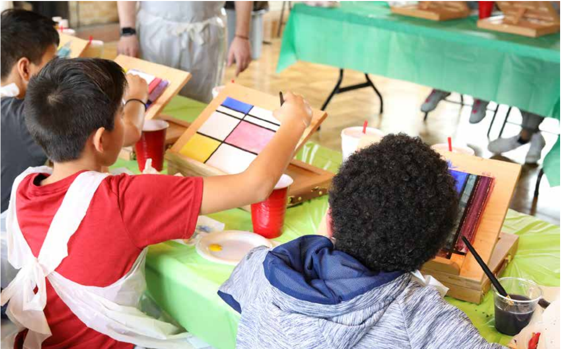
Have Art, Will Travel program conducted at the Amarillo Children's Home