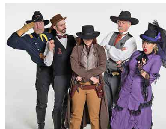
Lagniappe Production's Lone Star Murder Mysteries cast will be performing at PPHM during our Wild West Murder Mystery Dinner.