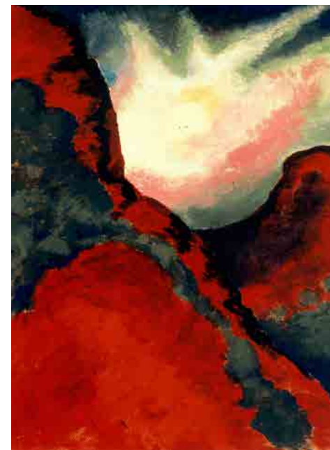
Georgia O'Keeffe (1887-1986) Red Landscape 1917 Oil on board Gift of The Georgia O'Keeffe Foundation

Lone Star Murder Mysteries are set in the 1880s, when Texas was wild and cattle were king. A time when the glow of lanterns along with the sounds of music and laughter from the local saloon, created a welcome oasis for thirsty cowboys. Rustlers, wranglers, gamblers, saloon girls, and lawmen were just a few of the colorful characters who wove the romantic tapestry of this bygone era. We invite you to take a light-hearted trip back to our version of the wild west, where laughs fly like