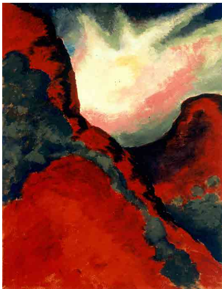
Georgia O'Keeffe (1887-1986) Red Landscape 1917 Oil on board Gift of The Georgia O'Keeffe Foundation