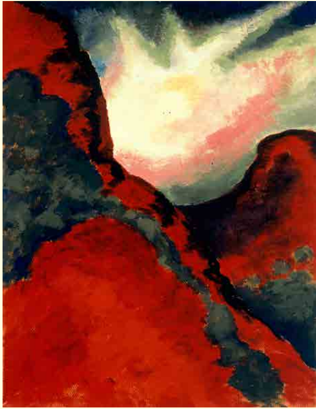
Georgia O'Keeffe (1887-1986) Red Landscape 1917 Oil on board Gift of The Georgia O'Keeffe Foundation