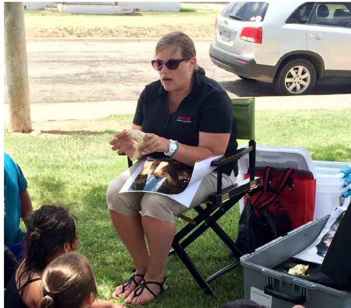
Community outreach at The Amarillo Bookmobile.

Barring unforeseen delays, PPHM’s multi-talented exhibits staff will have the new Foran Family Galleries ready for unveiling in the spring of 2017.