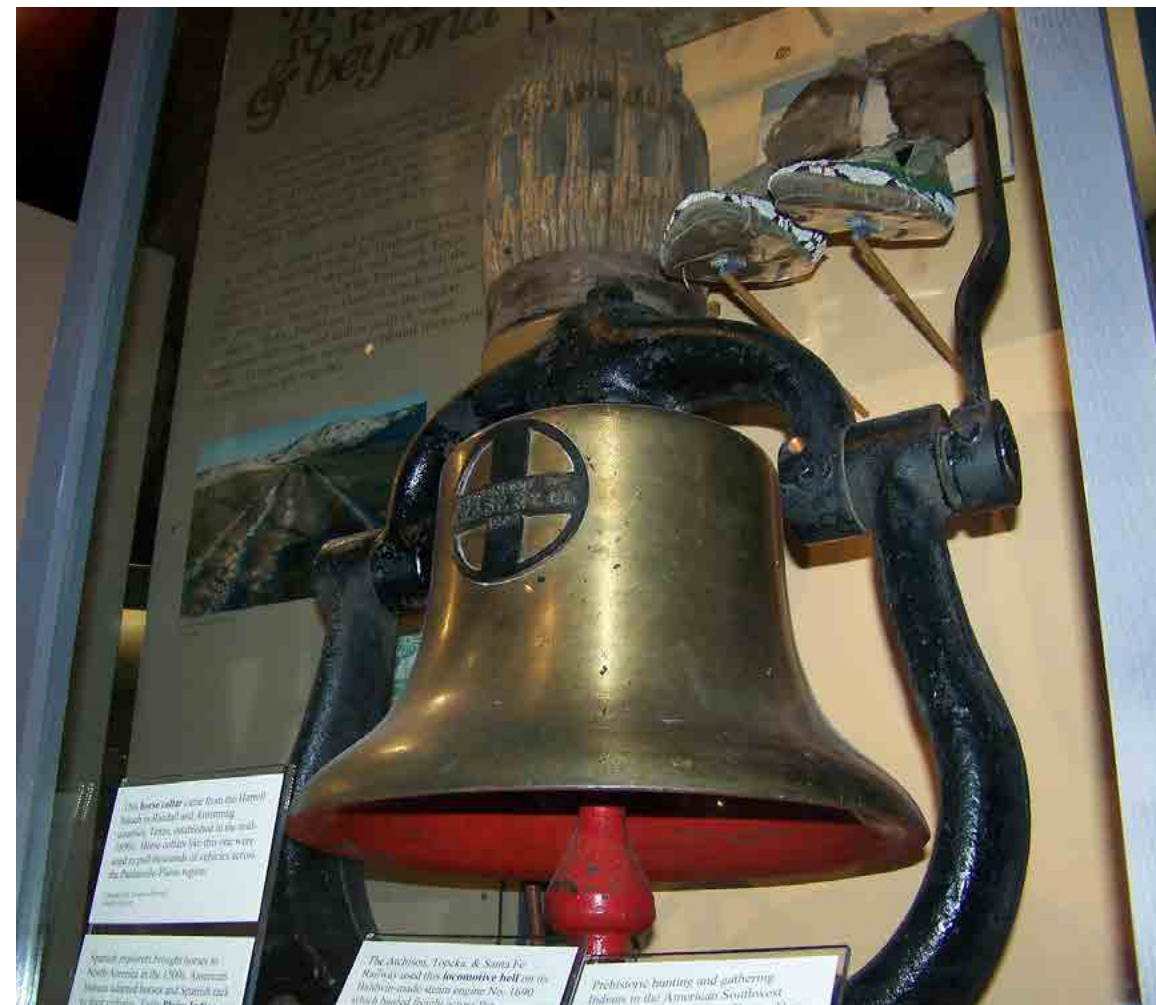
Locomotive Bell donated by the Santa Fe Railway