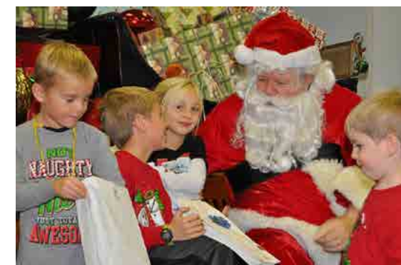
Christmas Open House always has a jolly Santa there for the children to meet.

Sometimes interpreting art can inspire different forms of artistic expression. Join us for an afternoon of learning how to use pieces of art, like Georgia O'Keeffe's Red Landscape , as inspiration for makeup looks. You will learn techniques from a makeup artist and get to see the looks come to life right in front of you. Participants will also be given information and samples to take home. We invite you to join us, and bring a friend, to this fun and interesting afternoon event! Cost is $10 for members and $15 for nonmembers.