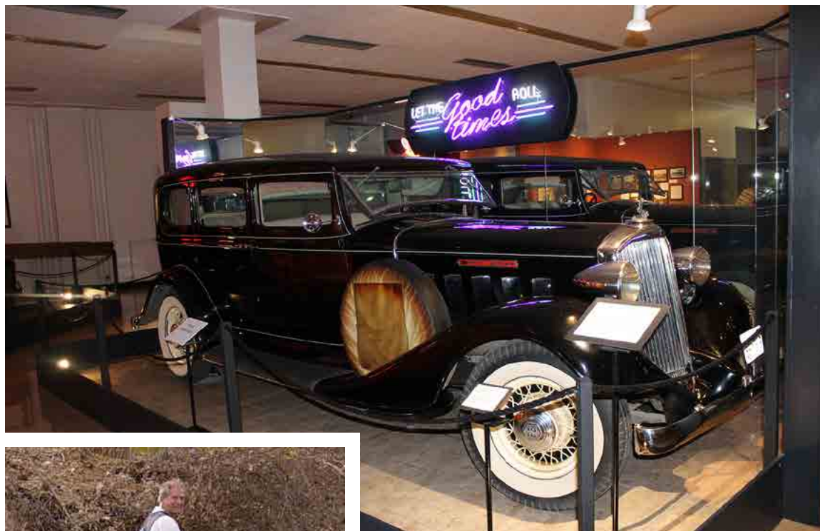
Above: 1933 Pierce-Arrow Seven-Passenger Sedan in PPHM's Let the Good Times Roll exhibit