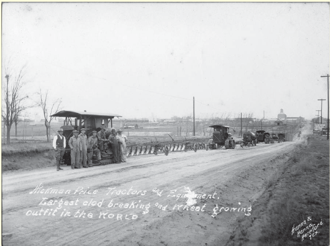
Hickman Price, tractors and equipment. Andrew Price papers, Panhandle-Plains Historical Museum.