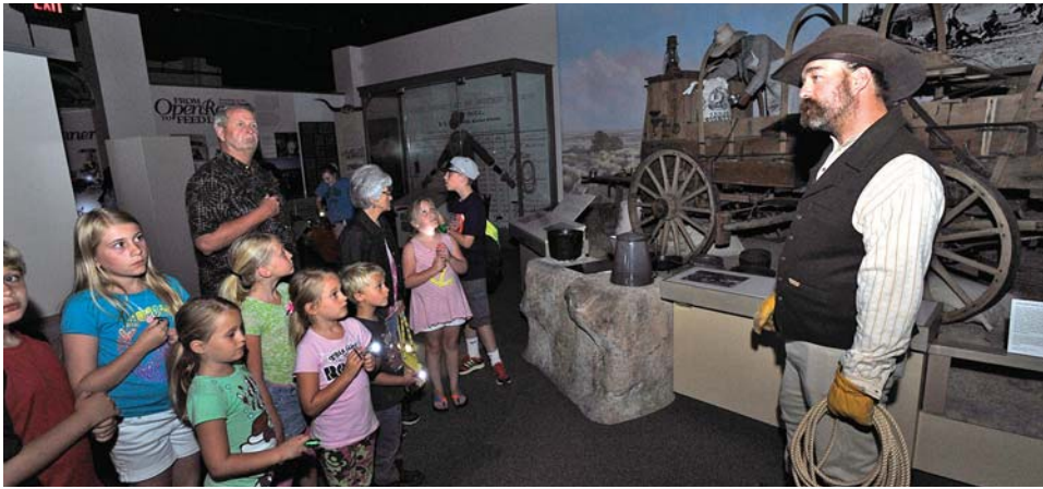
Visitors enjoy fun around every corner during Night at PPHM.