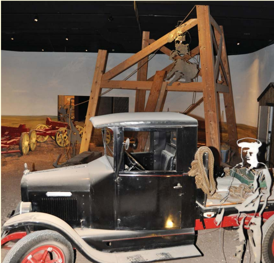
Petroleum programing will be a part of the STEM grant.