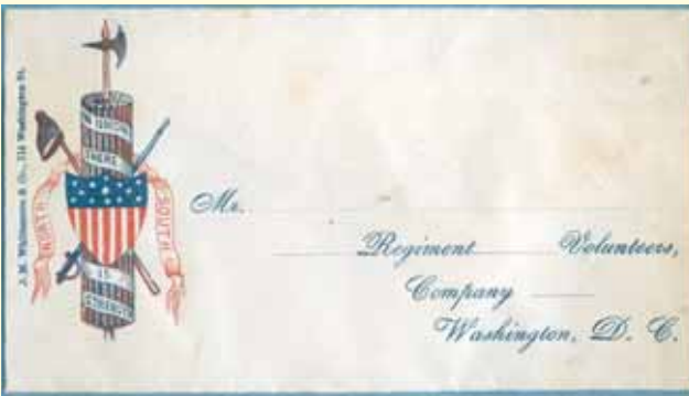
Civil War envelope from the Irene Farwell Hamilton scrapbook