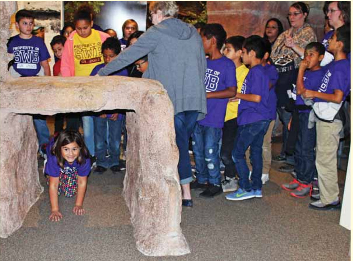
Grant Winners from Tulia, TX, Swinburn Elementary