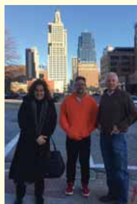
PPHM members took in the sights of Kansas City in December 2017.