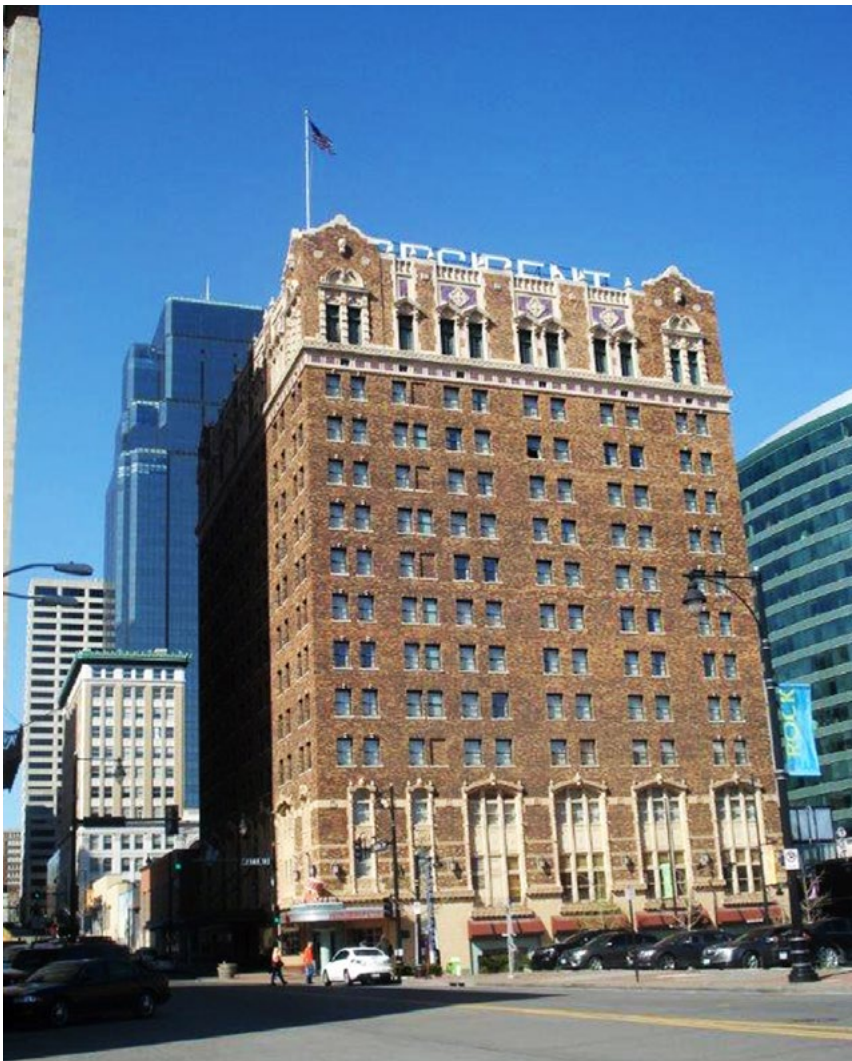
Hotel President in downtown Kansas City, sister of Amarillo's Herring Hotel.