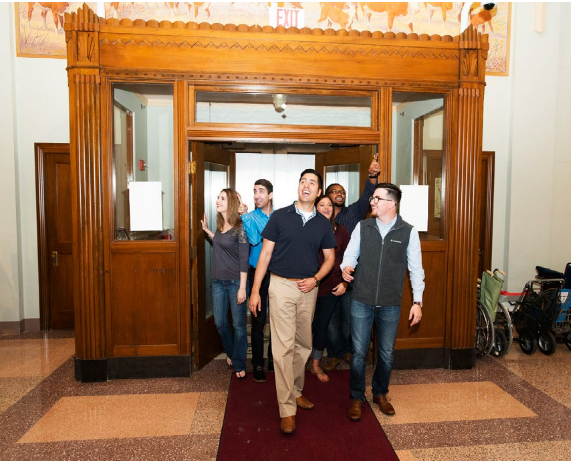
Visitors enjoying PPHM