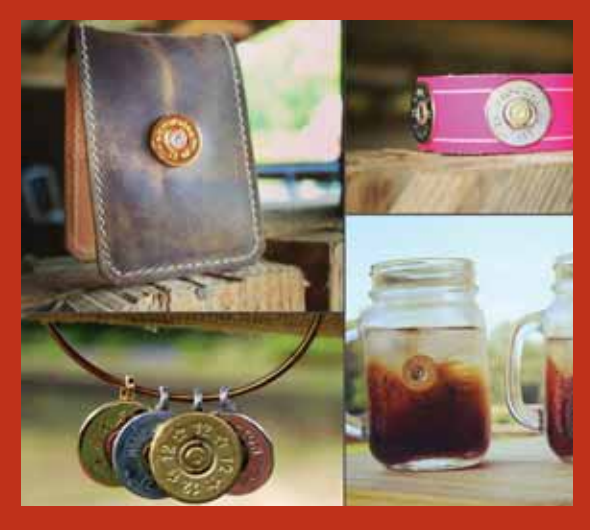
South-Life unique jewelry incorporates a bullet casing or shotgun shell into the design.

Panhandle-Plains Historical Museum Store is excited to announce our exclusive new selection of Lizzy J's and South-Life products! A true expression of Southern life at its best, each unique piece incorporates a bullet casing or shotgun shell into the design. These are available only at the Panhandle-Plains Historical Museum Store so stop by and let our store associates show you this unique selection today!