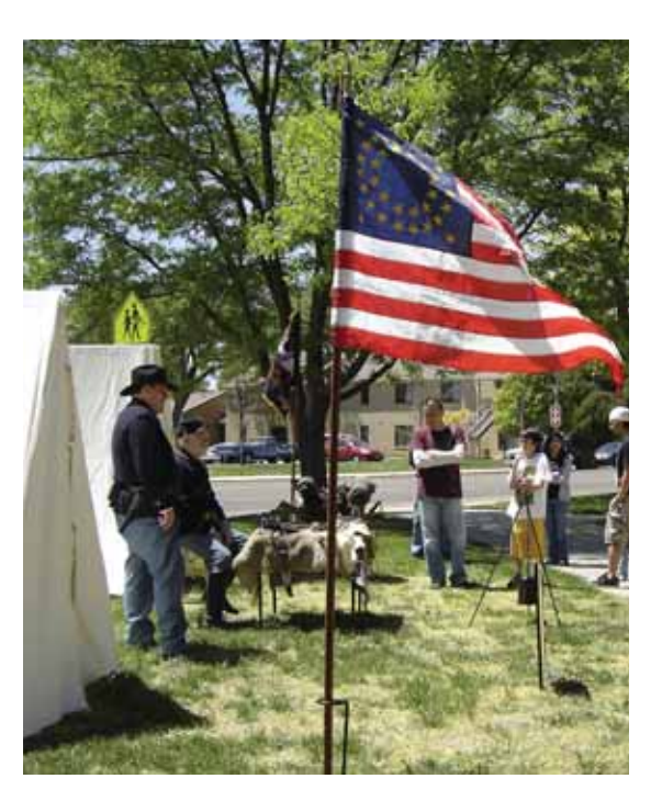
Spring RoundUp is coming back to PPHM!