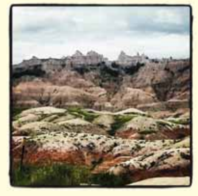
Badlands National Park during training.

Project Archaeology uses archaeological inquiry to foster understanding of past and present cultures; improve social studies and science education; and enhance citizenship education to help preserve our archaeological legacy. Project Archaeology is a joint program of Montana State University and the Bureau of Land Management. The program began in Utah in 1990 as a statewide project to combat the vandalism and looting of archaeological sites.