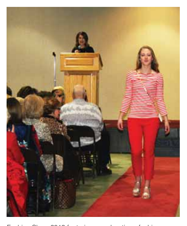
Fashion Show 2013 featuring area boutique fashions.