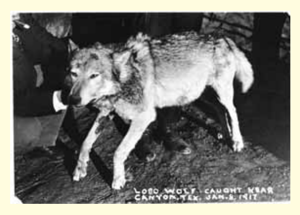
Lobo Wolf Caught Near Canyon, TEX Jan 8, 1917

mounted and on display in the Museum's Natural History area. This exhibition will be featured in the Alexander Gallery from March 7, 2015 through February 6, 2016.