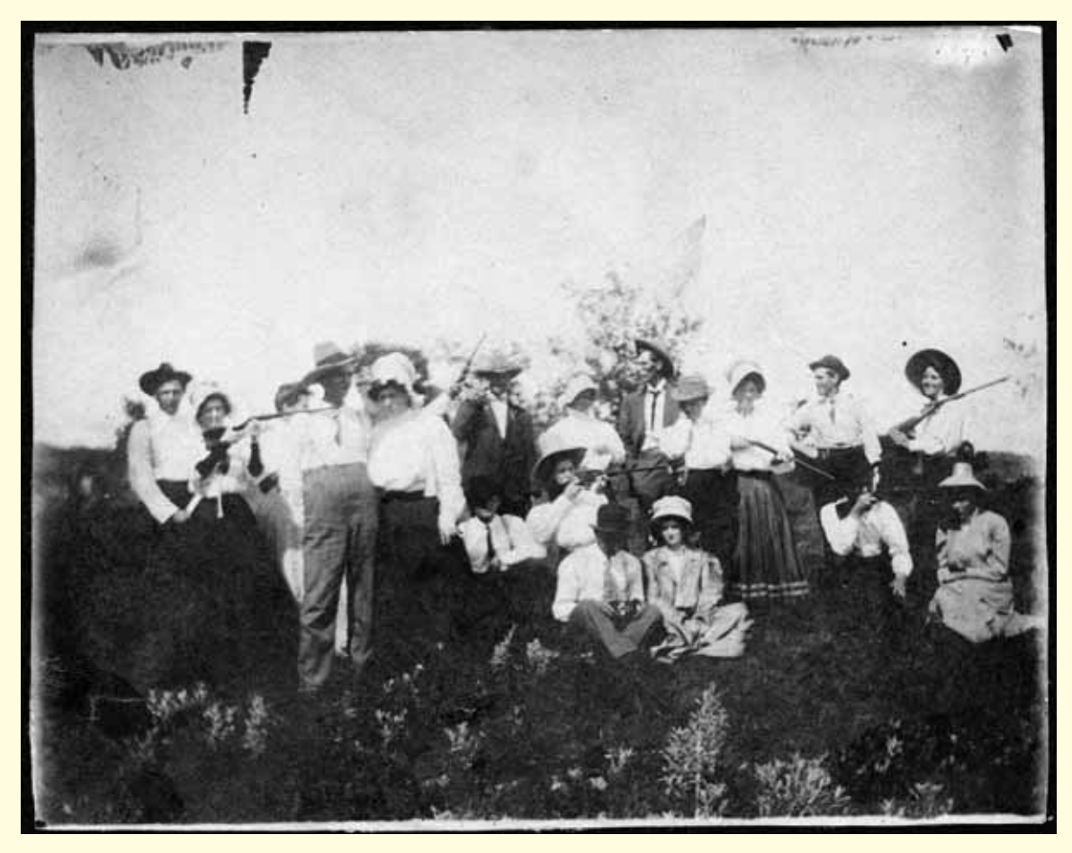
Photo to be featured in the Wildlife and Hunting Photograph Exhibition donated by P.W. Meyers.