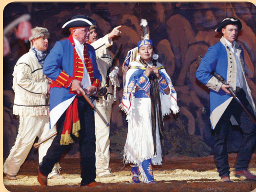
Lewis and Clark

F ighting breaks out, followed by peace. The scene changes to that of a wild frontier town. Watch rattling stage coaches, the pony express, a bank robbery, dance hall fun, fires, romance, and a hick band. Experience the hustle and bustle of the bygone days of the Old West. The finale includes Happy Canyon's unique Cowboy and Cowgirl square dance on horseback.