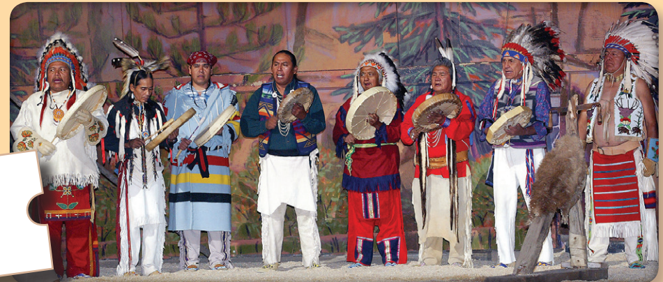
You'll see colorful, authentic Indian regalia and watch as traditional native culture is relived.