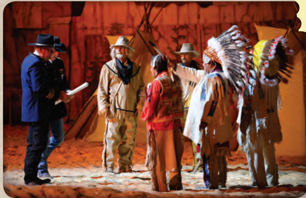
Lewis and Clark

You'll see colorful, authentic Indian regalia and watch as traditional native culture is relived.