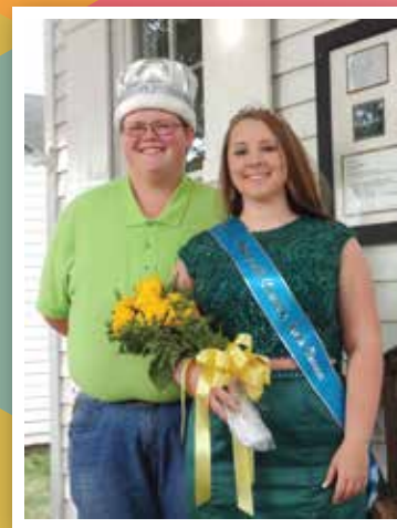
2018 PLYMOUTH COUNTY FAIR KING & QUEEN

Plymouth County 4-H and Agricultural Society Charitable Trust 251 12th Street SE Le Mars, IA 51031 NON PROFIT ORG U.S. POSTAGE PAID PERMIT NO. 29 LE MARS, IA 51031 *****ECRWSEDDM***** LOCAL POSTAL CUSTOMER