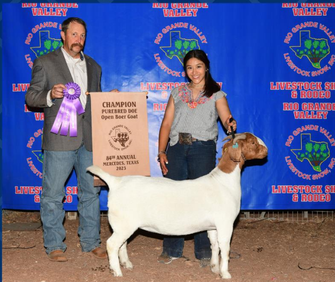
2023 CHAMPION PUREBRED DOE MAYA MORENO EDINBURG VELA FFA