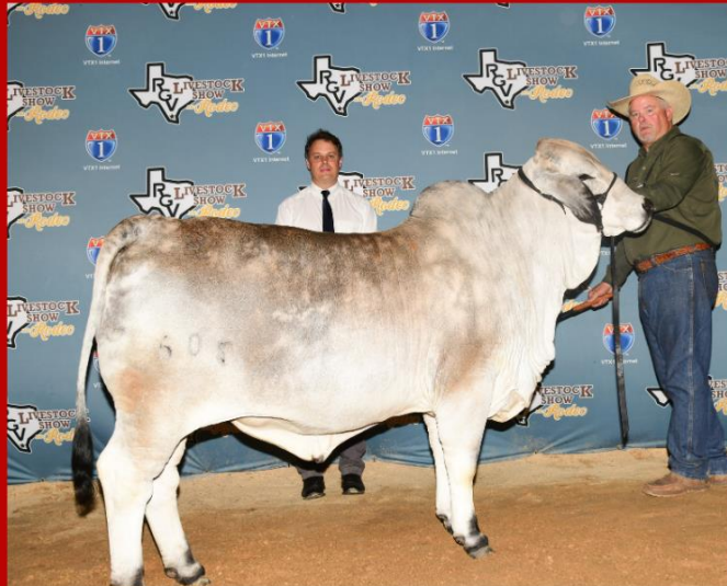
2024 Champion Brahman Female - Grey V8 Cattle, Co.