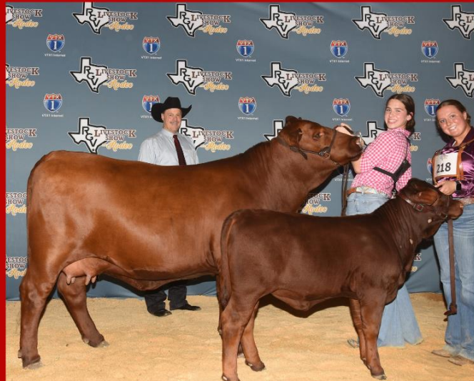
2024 Champion Santa Gertrudis Female Straits Ranches