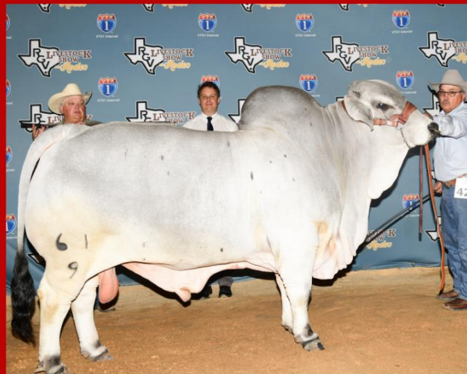
2024 Champion Brahman Bull - Grey Walters Livestock