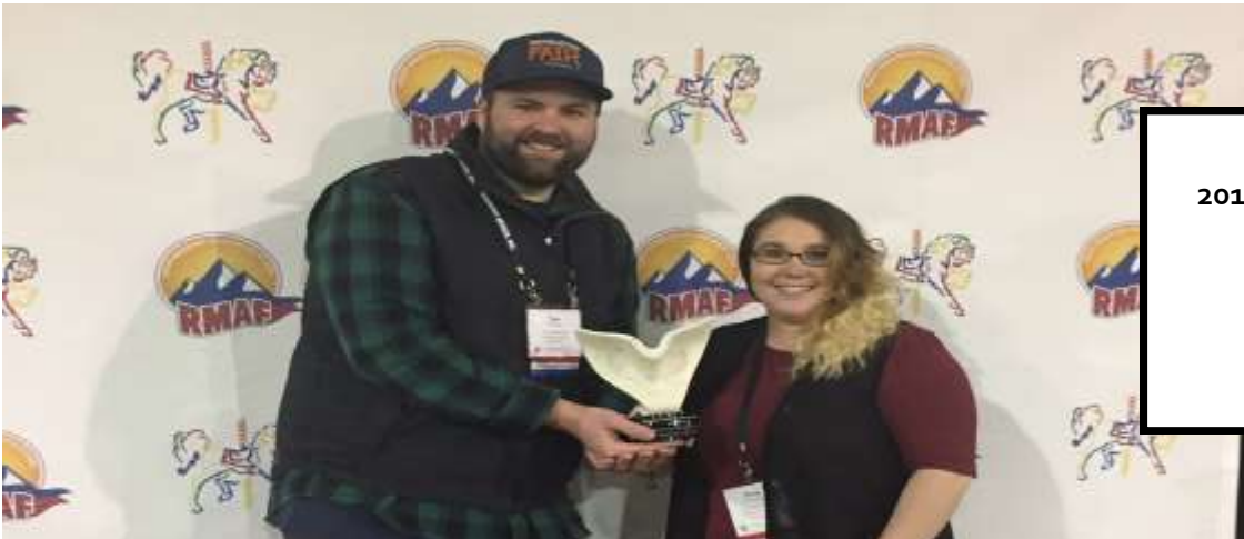
2018 ISA - Renner Innovation Award Winner Western Montana Fair Missoula, Montana