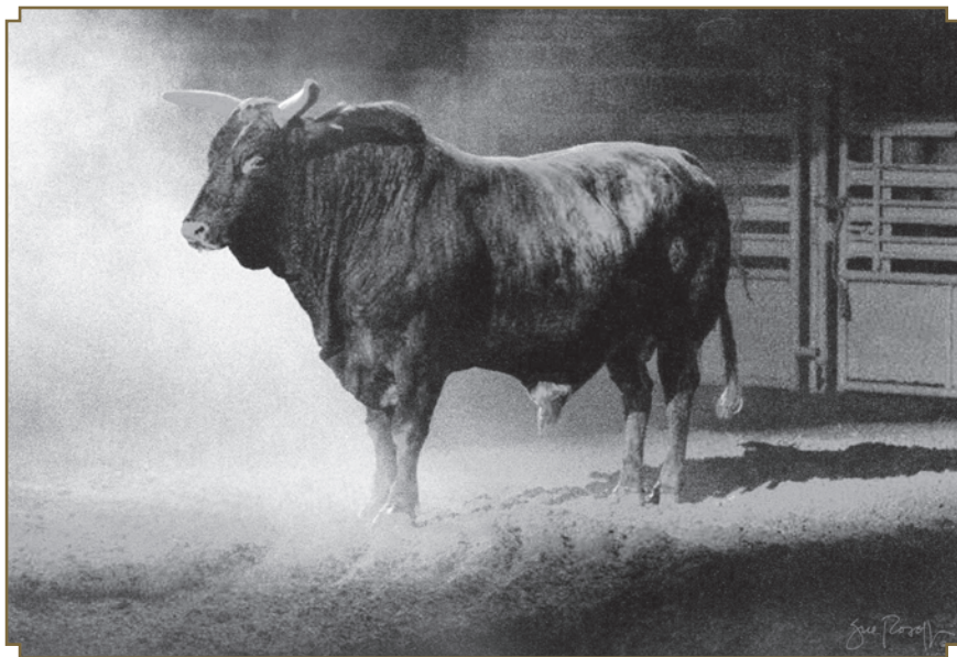
Red Rock at Lane Frost Memorial Night 1989 NFR