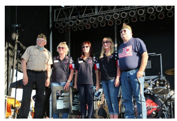
RIB COOK-OFF Hosted by local Fire and Law Enforcement

Wednesday, July 13, 2022, at the PETRO SERVE USA Stage in Hartl Building