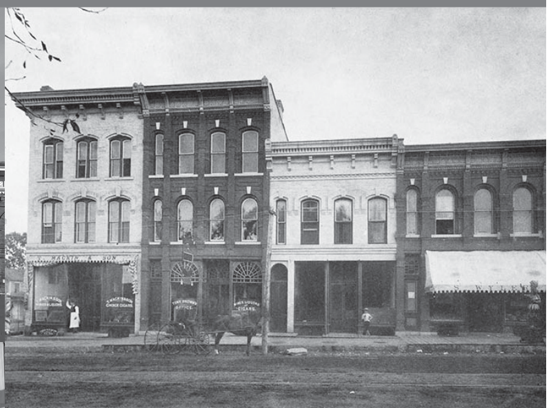
West Milwaukee Street.