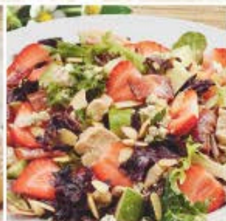
Strawberry-Apple Poppyseed Salad