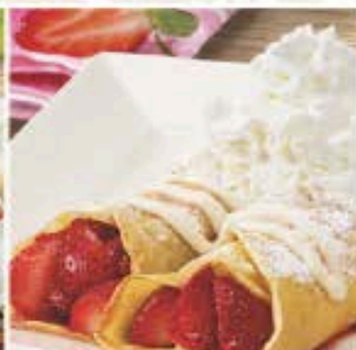
Fresh Strawberry Crepes