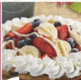
Fresh Fruit Waffle

We'll donate $1 to the Portland Rose Festival Foundation for every Rose Meal purchase!