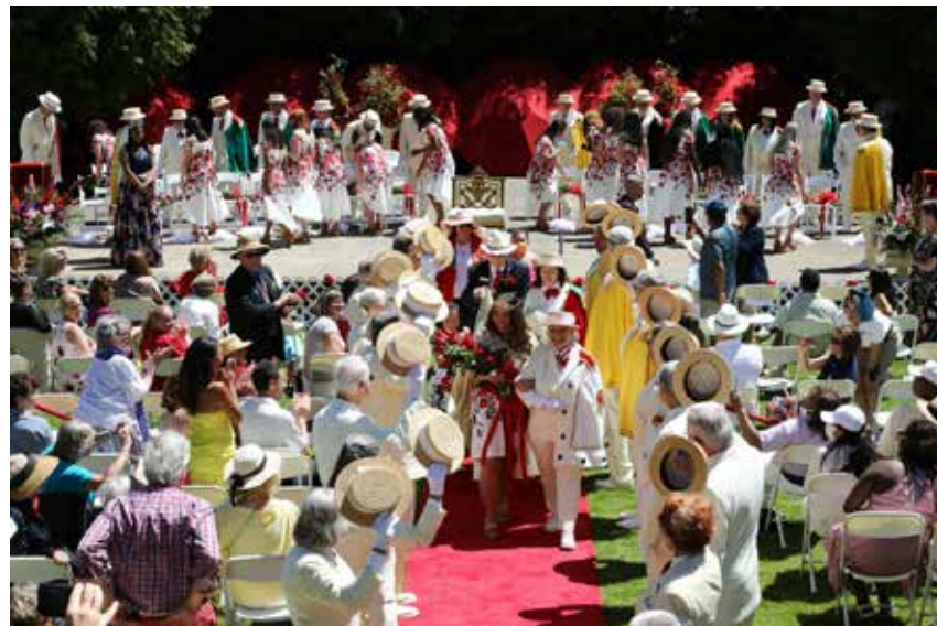
The International Rose Test Garden served as a backdrop for the Queen's Coronation, the only major in-person event held outdoors for the 2021 Rose Festival season.

Re-emerging with a return of large-scale world-class events is not easy. There is no switch to flip or reset button to press. The road is long and the challenges are plentiful, but the Portland Rose Festival Foundation is up to the task. We are honored to have the opportunity to present a celebration to our community, as we have for more than a century, thanks to the generous support of so many. Hope Reigns!