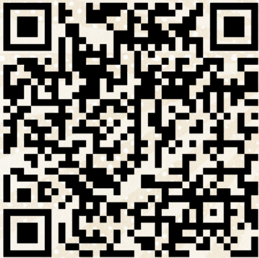
Trailer Release QR Code

https://www.sarodeo.com/p/competitive-events