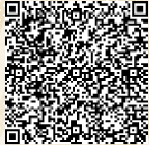
Pre-Order Shavings QR Code