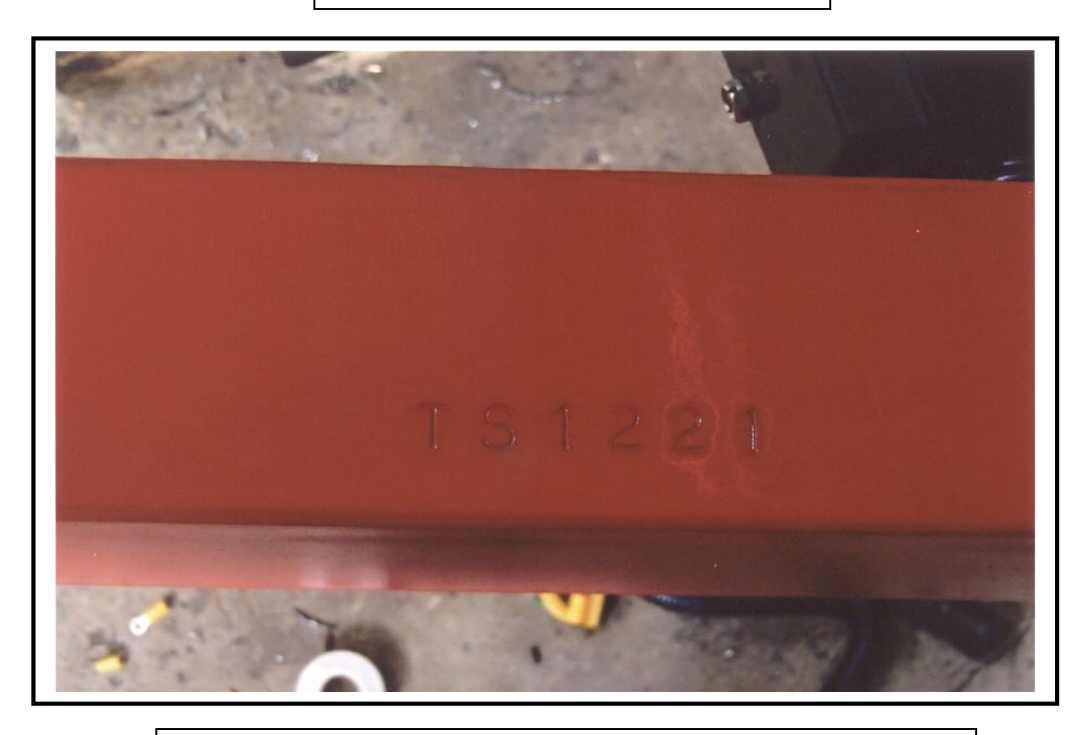
Identification (VIN) Number stamped on frame of trailer