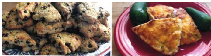
DONNA'S RUSTIC SCONES