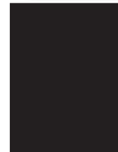
FULL PAGE | $1000 8.5 in. x 11 in. *.25 in. bleed