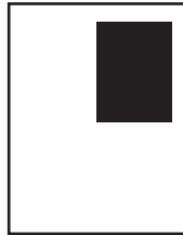
QUARTER PAGE | $500 5 in. x 3.5 in. *Vertical Only