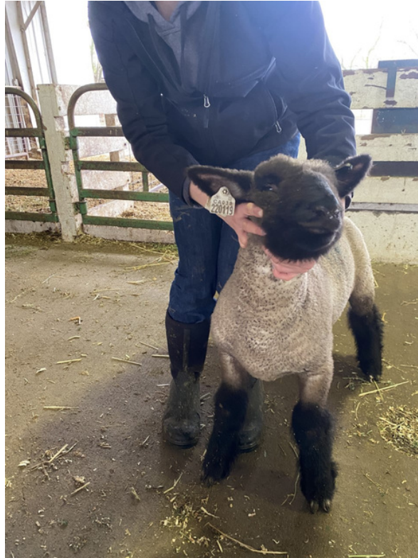
Front View of Lamb

Exhibitor with lamb/goat showing scrapie tag (both sides if both sides are printed). It is super important that the ear tag is clean and can be read easily so the livestock team can correctly enter it into our system.