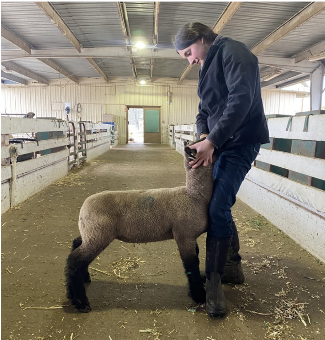
Photo must show entire animal, as close and clear as possible to identify animal and exhibitor.