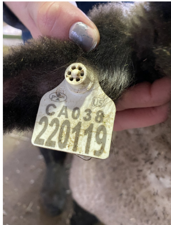
Front View of Scrapie Tag