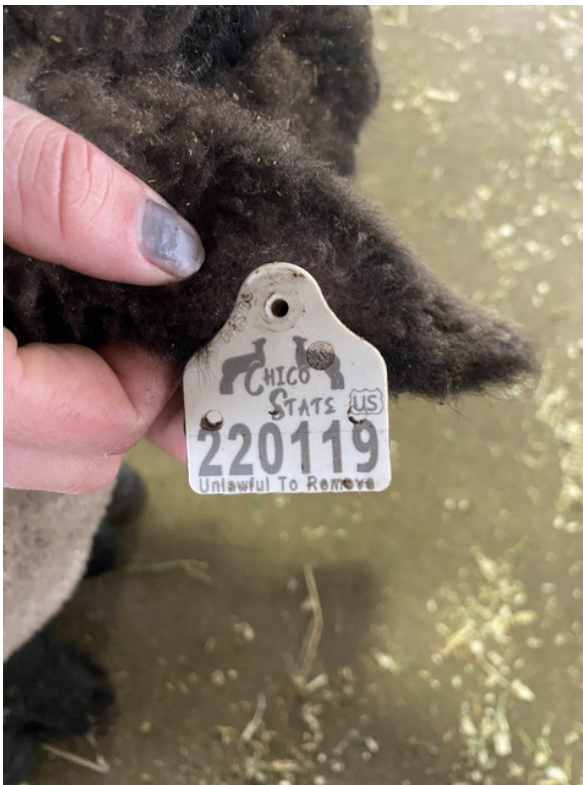
Back View of Scrapie Tag