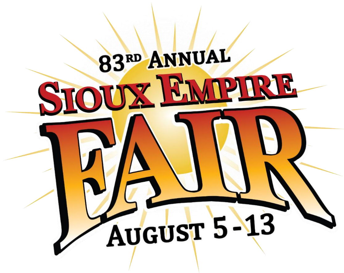
Exhibit Submission Day is Wednesday, August 3 rd , from 12PM until 7PM sharp!

** NOTE: The New Location of the Arts Center will be in the Expo's North Room. See map inside. **