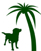
Boca Raton Dog Club