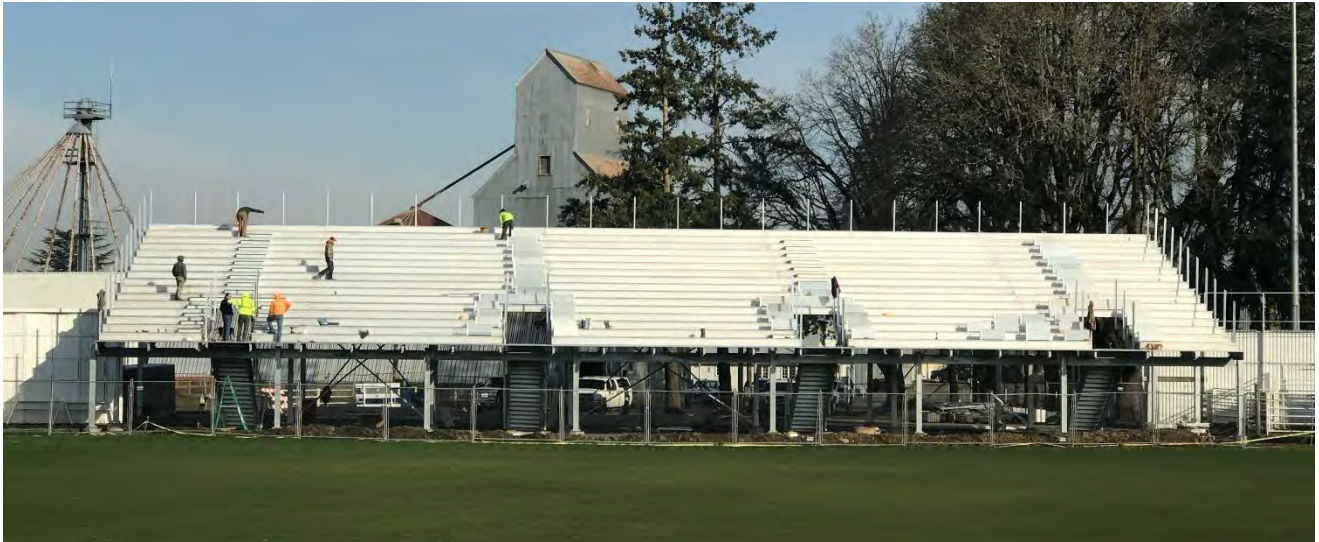
Section F is making progress, photo taken Feb. 1, 2023. Stairs and 16 rows are quickly coming together.