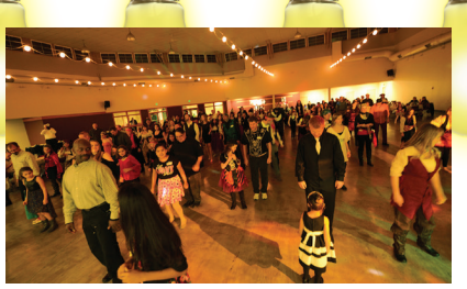
Kiwanis Father Daughter Dance and Dinner in the Modern Living Building.

The Modern Living Building (16,000 square feet) is always a popular event building at State Fair Park throughout the year. And it just got better! Rows of party lights were added to enhance the atmosphere and give it a more "festive" look and feel.