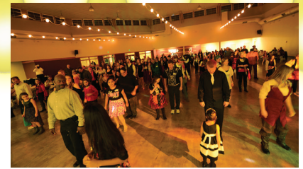
Kiwanis Father Daughter Dance and Dinner in the Modern Living Building.

The Modern Living Building (16,000 square feet) is always a popular event building at State Fair Park throughout the year. And it just got better! Rows of party lights were added to enhance the atmosphere and give it a more "festive" look and feel.