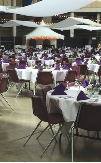
Yakima Valley Farm Workers Holiday Dinner in the SunDome