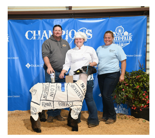
2023 Educational Expo

Visit the different livestock pavilions on your field trip. Don't miss the cattle, sheep, goats, pigs and dairy cows and goats. Be sure to talk to the exhibitors that have put so much time and energy into preparing for this moment. The types of animals being shown rotate throughout the 10 days of the fair. A full schedule will be available closer to fair.