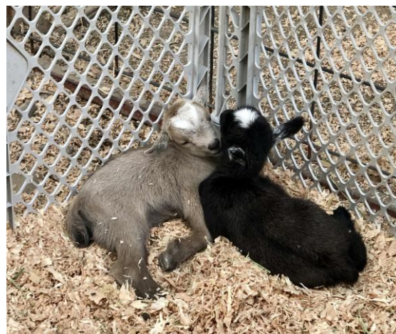
NEWBORN GOATS DURING FAIR 2024