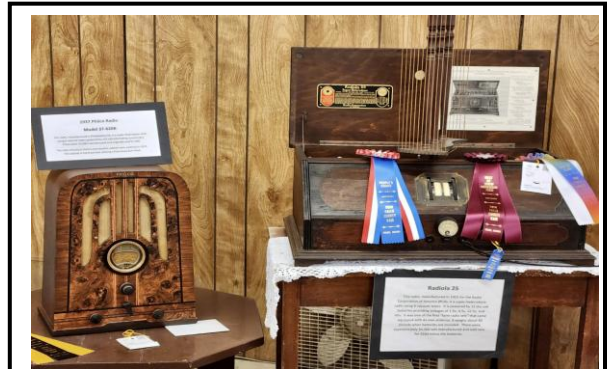
2025 BEST OF SHOW INDIVIDUAL PEOPLE'S CHOICE PERRY VANPATTEN

Sept. 2 nd – Sept. 7 th 'STARS, STRIPES & STAMPEDES' 250 YEARS OF AMERICAN SPIRIT