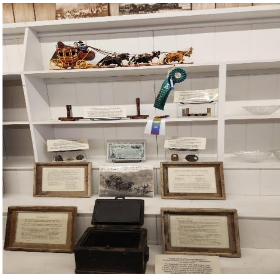
BEST DISPLAY 2025