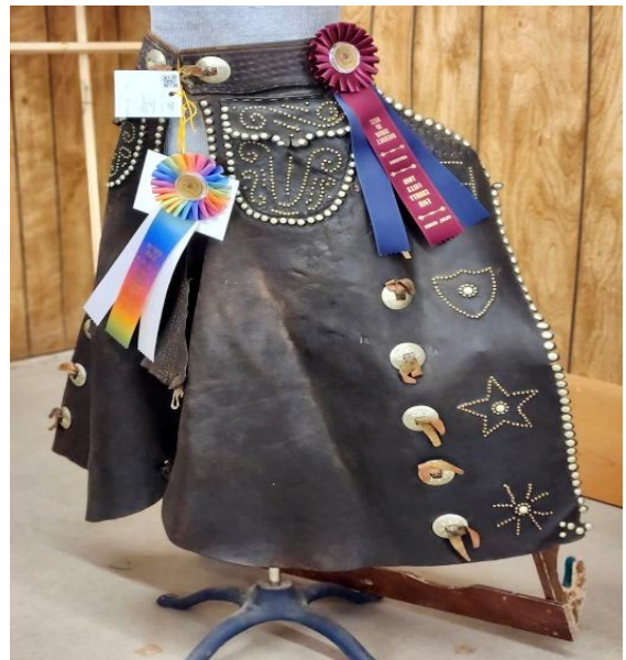
BEST OF SHOW OVERALL 2025