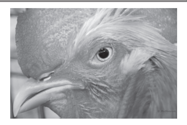
Hours available for poultry exhibit PICK-UP: Sunday, September 17th - Must be picked-up by 1:00 p.m.

All birds must be in their assigned coops by 8:00 a.m. Sunday, September 10th. No Exceptions! Judging will begin Sunday, September 10th at 9:00 a.m. Exhibitors will not be permitted to make changes to their entries once the birds reach the show area.