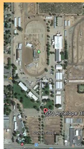
The Tehama District Fairgrounds