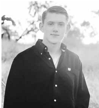
COOPER FORD Rio Grande Valley Livestock Show