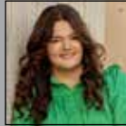
Cora Ford Rio Grande Valley Livestock Show & Rodeo