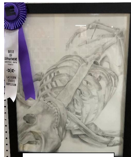
Drawing by Rachel Stumpf (Youth)

Due to exhibit space limitations, we are accepting only one type of medium each year.