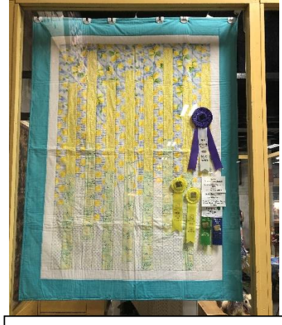
Quilt by Luciana DeRise (Youth)

You must indicate on your entry form if your item was made from a kit. A kit includes the pattern and the fabric.