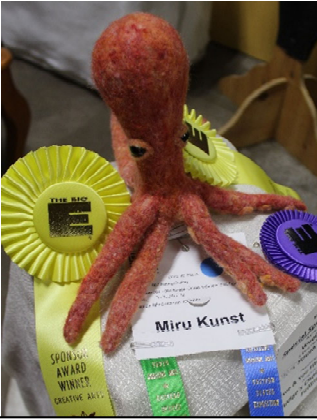
Felting by Miru Kunst (Youth)

If you created your own hand carded material, please attach a small card describing what pieces were created by you.