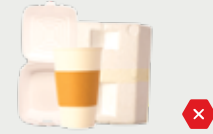
NO Foam Cups or Containers