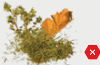
NO Green Waste