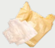
NO Loose Plastic Bags, Bagged Recyclables or Film Empty recyclables directly into your cart.