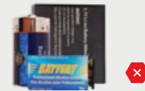
NO Hazardous Waste or Batteries