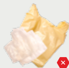
NO Loose Plastic Bags, Bagged Recyclables or Film Empty recyclables directly into your cart