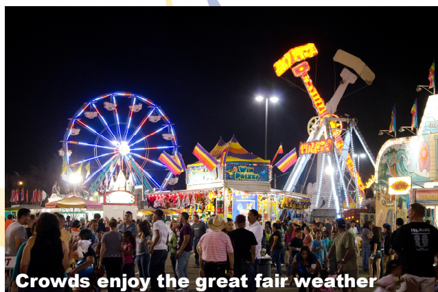
Crowds enjoy the great fair weather