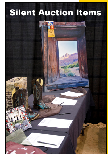
Silent Auction Items