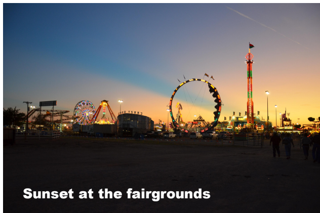
Sunset at the fairgrounds

We look forward to serving you throughout the upcoming year and look forward to seeing you Sept. 14-22, 2012 for the 89th Annual Texas Farm Bureau Insurance Companies Tri-State Fair & Rodeo.