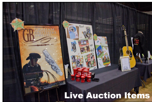
Live Auction Items